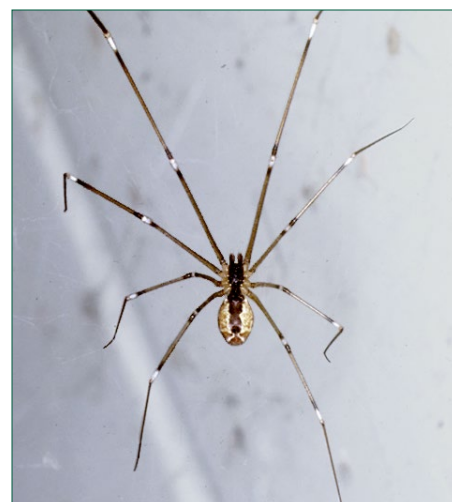
Figure 10. Marbled cellar spider often is confused with brown recluse spider despite the fact that the perceived violin-shape is on the underside of the body.