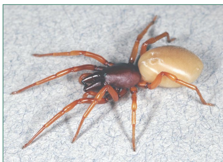
Figure 7. The woodlouse spider has 6 eyes arranged in trios, not pairs. Additionally, they have no violin pattern on the cephalothorax.

Many common tan or gray spiders have dark markings on the head region, which convinces people that they have caught a true recluse spider. These spiders include cellar spiders ( Pholcus phalangioides , Psilochorus spp., Physocyclus spp.) (Figure 8), pirate spiders ( Mimetus spp.) (Figure 9), and