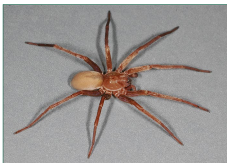
Figure 11. Titiotus spp. female.