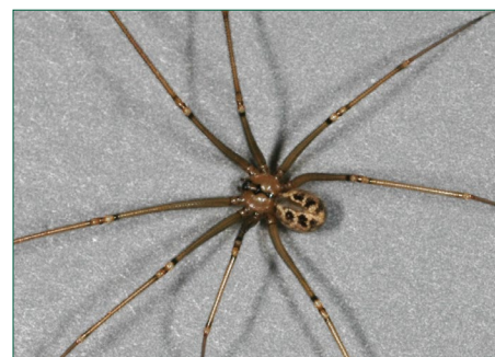
Figure 8. This cellar spider ( Psilochorus spp.) has a dark marking that looks very much like that of a brown recluse but the dark markings on the abdomen indicate that it is not a recluse spider.

Virtually every spider that is tan or brown has been turned in by Californians as a potential brown recluse. There are hundreds of species of these spiders in California. They include ground spiders (Gnaphosidae), sac spiders ( Cheiracanthium spp., Trachelas spp.), wolf spiders