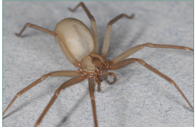
Figure 1. Brown recluse spider, Loxosceles reclusa .

All known members of the group have scientific names, and the more familiar members of this group also have common names (e.g., brown recluse, desert recluse, Arizona recluse).