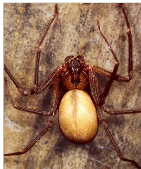
Figure 5. Brown recluse spider showing the uniformly colored legs covered with fine hairs.

In the unlikely event that one does find a recluse spider in California, it will most likely be the native desert recluse, Loxosceles deserta . To identify Loxosceles spiders to species level requires a high-magnification microscope and the skills of a spider expert (arachnologist).