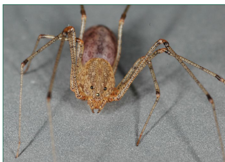
Figure 6. A spitting spider has the same 6-eye pattern as a recluse spider but the body coloration looks nothing like a recluse.

submitted in great numbers including many false black widows, woodlouse, and yellow sac spiders.