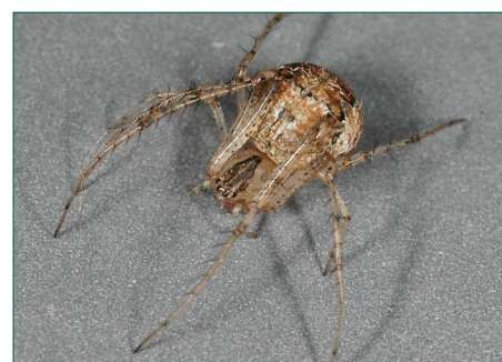
Figure 9. This pirate spider (genus Mimetus ) has a dark marking mistaken as the violin of a recluse spider but can be distinguished as not a recluse by having 8 eyes, conspicuous leg spines, and more than one color on its abdomen.