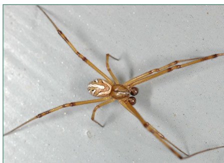
Figure 12. Male black widow spider.