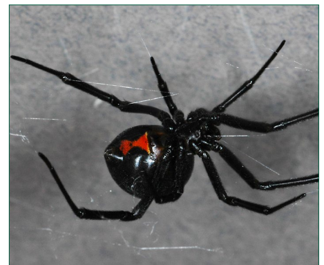
Figure 2. Underside of adult female black widow spider.