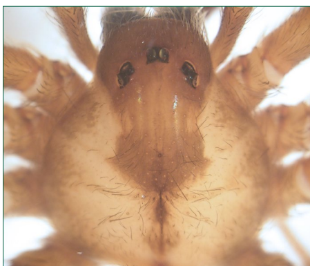
Figure 3. Close-up of the cephalothorax (head region) of a brown recluse showing the typical arrangement of eyes.