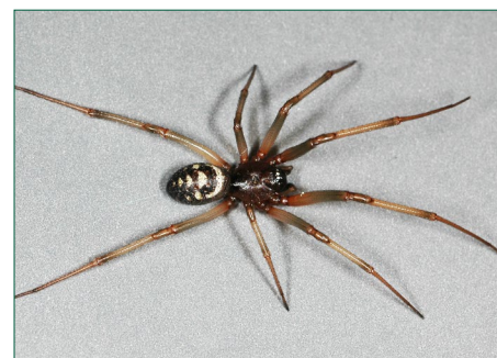
Figure 13. Male false black widow spider.

(Lycosidae), grass spiders (Agelenidae), orb weavers (Araneidae), and male crevice spiders (Filistatidae).