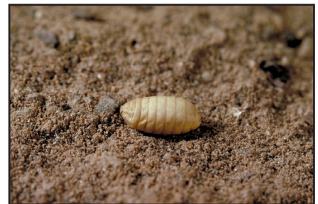
Figure 7. Walnut husk fly pupa on a soil surface.