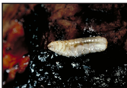
Figure 2. Walnut husk fly larva feeding beneath the skin of a walnut husk.