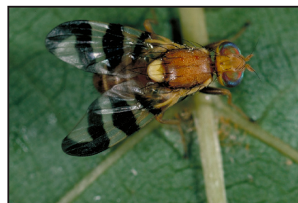
Figure 1. Banded wings of the adult walnut husk fly.

Certain general sanitation practices that reduce the number of husk flies