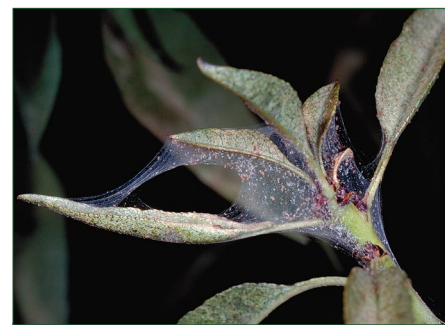
Figure 5. Spider mites and webbing, Tetranychus species.

Other mites, including the broad mite and cyclamen mite, can cause problems, as well. These mites are very tiny (0.0008 inch long (0.02mm)) and nearly impossible to see without a microscope. Infestations are recognized by plant injury symptoms rather than by seeing the mites themselves. Usually, feeding injury is evident on new growth and is characterized by thickened and brittle foliage, with stunted and downward-cupped leaf margins. Some of these symptoms