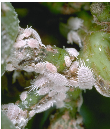
Figure 4. Obscure mealybugs, Pseudococcus viburni .

For more information see UC IPM Pest Notes: Fungus Gnats .