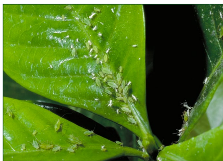
Figure 3. Green peach aphids, Myzus persicae , and cast skins on gardenia leaves.

For general information about aphids and aphid management, see the UC IPM Pest Notes: Aphids .