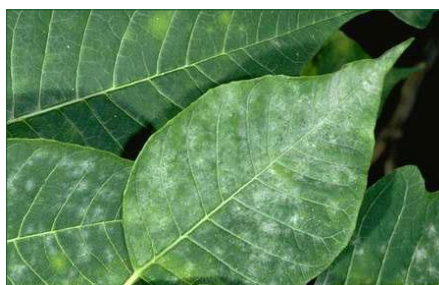
Figure 8. Powdery mildew, Erysiphe euphorbiae , growth on tree poinsettia leaves.

Systemic bacterial diseases. Many bacterial pathogens found on indoor plants can invade the vascular tissues of the plant and spread throughout