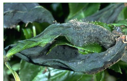
Figure 9. Decay and spores of Botrytis cinerea fungus infecting impatiens leaves.

its system. If conditions are favorable, these pathogens may begin to multiply in various areas of the infected plants and cause stem rots, leaf blights, wilts, and even root rots. These systemic bacterial diseases can cause wilting and general yellowing of plants. Systemic diseases may occasionally cause rotting or cankering of the stem tissue. The cankers or rots will be soft and mushy in appearance and may have an unpleasant odor.