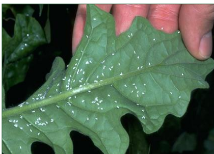
Figure 7. Adult silverleaf whiteflies, Bemisia argentifolii .

Whiteflies. Both adult and juvenile whiteflies (Figure 7) attack houseplants. The largely immobile juveniles attach to the underside of leaves, suck plant juices, and excrete honeydew. The adults are small, white to yellowish winged insects that may be seen flying around infested plants. Whiteflies commonly infest poinsettias and many other plants, causing leaves to yellow and drop.