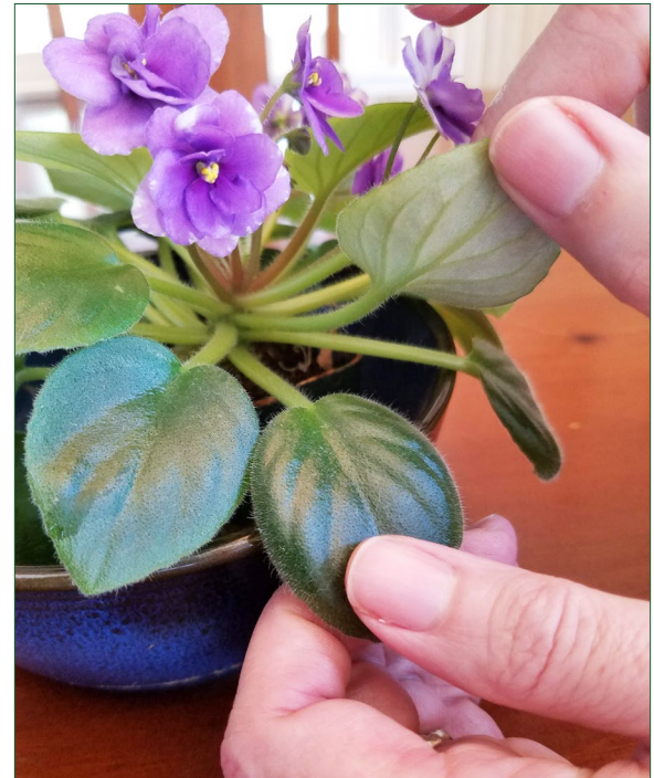
Figure 1. Examining leaves of an African violet houseplant for pests.

In many instances, solving the problem or treating the pest will be difficult. Once a problem has been detected, it is sometimes not practical to restore a plant's health; it may be too late to solve the problem, and effective management for the pest may not be available. In these cases, it may be better to discard the plant and purchase a new one.