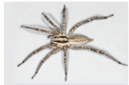
Figure 4. Agelenopsis aperta , an adult funnel web spider.

In its native European habitat, hobo spider venom is not considered toxic