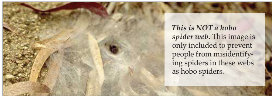
Figure 3. Funnel web made by a typical agelenid spider.

Exceptions are the spiders of the genera Tegenaria and Eratigena , which have