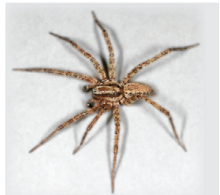
Figure 5. Hololena tulareana , an adult funnel web spider.