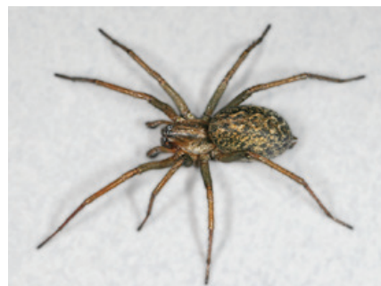
Figure 1. Adult hobo spider, Eratigena agrestis .

More typical members of this family construct a funnel web, which is a trampoline-like, horizontal web constricting back into a funnel or hole (Figure 3). The web is typically found in a crack between bricks, or under wood, stones, or vegetation. The spider waits in the mouth of the funnel for prey to fall onto the horizontal surface and then rushes out, grabs the prey, and takes it back to its funnel to consume. If you go outside on a dewy morning,