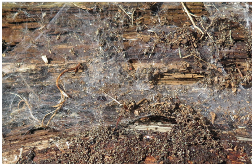
Figure 2. Web of hobo spider, exposed on the underside of a piece of driftwood.