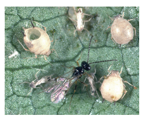
Figure 3. Aphid mummies and a parasitic wasp ( Lysiphlebus testaceipes ).

in addition to the host mortality caused by parasitism.