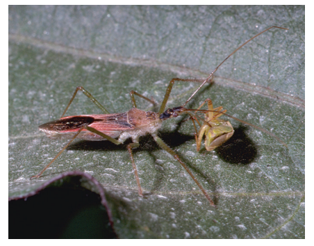
Figure 5. An adult assassin bug (Zelus renardii) eating a lygus bug.

Eliminate or reduce the use of broadspectrum, persistent pesticides whenever possible. Carbamates, organophosphates, and pyrethroids kill natural enemies that are present at the time of spraying and for days or weeks after-