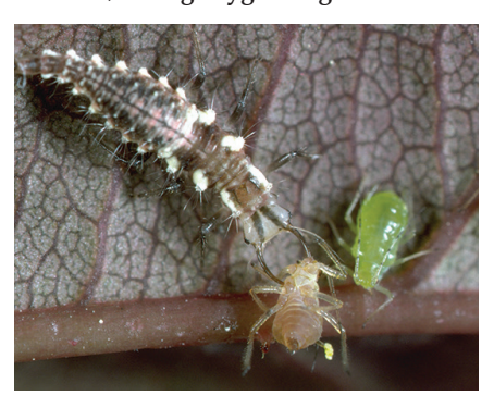
Figure 6. An alligatorlike green lacewing larva eating a rose aphid.

wards their residues kill predators and parasites that migrate in after spraying (Figure 7). Neonicotinoids (e.g., dinetofuran, imidacloprid) and other systemic insecticides that translocate (move) into blossoms can poison natural enemies and honey bees that feed on nectar and pollen. Even if beneficials survive an application, low levels of