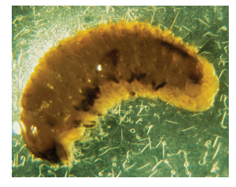
Figure 4. Entomopathogenic nematodes emerging from a root weevil larva they killed.

phidae, and Ichneumonidae are other groups that parasitize insect pests. It's important to note that these tiny to medium-sized wasps are incapable of stinging people. The most common parasitic flies are the typically hairy Tachinidae. Adult tachinids often resemble house flies. Their larvae are maggots that feed inside the host.