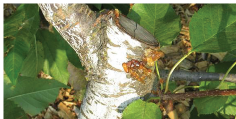
C. Ingels, UCCE Sacramento

— Chuck Ingels, UCCE Sacramento, caingels@ucanr.edu