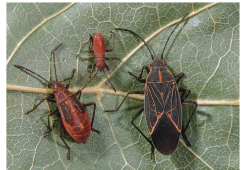
J. K. Clark, UC IPM

The best way to prevent nuisance pests from invading structures is to exclude them by sealing up possible entry points. To keep pests out, special attention should be focused on doors, windows, foundations, chimneys, roof joints, shingles, vents, and conduit ports. Door sweeps (Figure 3) and threshold seals can be installed to eliminate gaps under and around doors while new screens, weather stripping, and expanding foam may be necessary to seal up gaps in and around windows. Instruct your customers to seal up all cracks and openings on the outside of the structure using appropriate sealant materials for the site and situation. These materials may include mortar and cement products (for hardscape gaps), roof cement (for sealing chimney flashings), elastomeric sealants (for large gaps at joints subject to movement), expanding foams (for hard to seal gaps and for