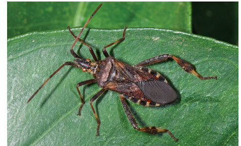
J. K. Clark, UC

Leaffooted bugs have piercing-sucking mouthparts that extend more than half of the length of their narrow body. They probe into leaves, shoots, and fruit to suck plant juices. For most ornamentals and many garden plants, feeding on the leaves and shoots causes no visual damage and is of little concern. Feeding on small tomatoes can cause the fruit to abort, while feeding on medium sized fruit can result in depressions or discoloration at the feeding site as the fruit expands and ripens. Feeding on mature tomatoes can cause slight discoloration to the surface of the fruit that should be of no concern to backyard gardeners. Damage is similar to that caused by stink bugs and other plant bugs.