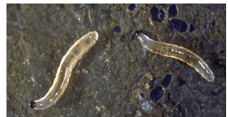
Figure 1. Fungus gnat adult trapped on yellow sticky trap.