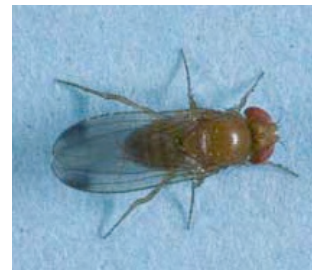
Male spotted wing drosophila showing spots on wings.

You can suggest they make a homemade trap by drilling holes in a quart-sized yogurt container and hang it in trees in early May before fruit ripens. Pour about an inch of apple cider vinegar and a drop of dishwashing soap in the trap and check for fruit flies weekly. Look for fruit flies with spots on their wings. These are the male spotted wing drosophila.