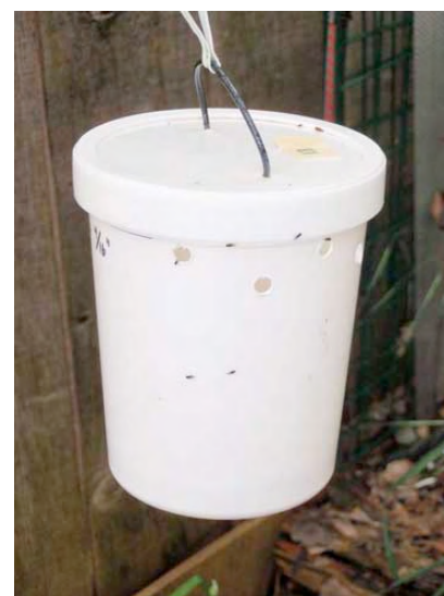
Spotted wing drosophila larva in fruit.