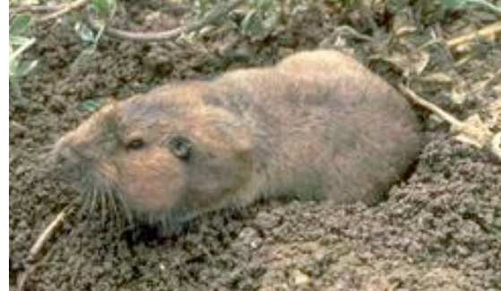
J. K. Clark, UC IPM

P ocket gophers ( Thomomys spp.) are one of the most damaging vertebrate pests in California. Gophers are short, stout burrowing rodents, usually 6 to 8 inches long. They spend most of their time below ground where they use their front legs and large incisors to create extensive burrow systems.