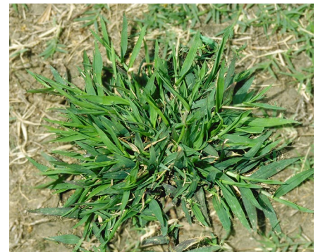
Figure 2. Smooth crabgrass.