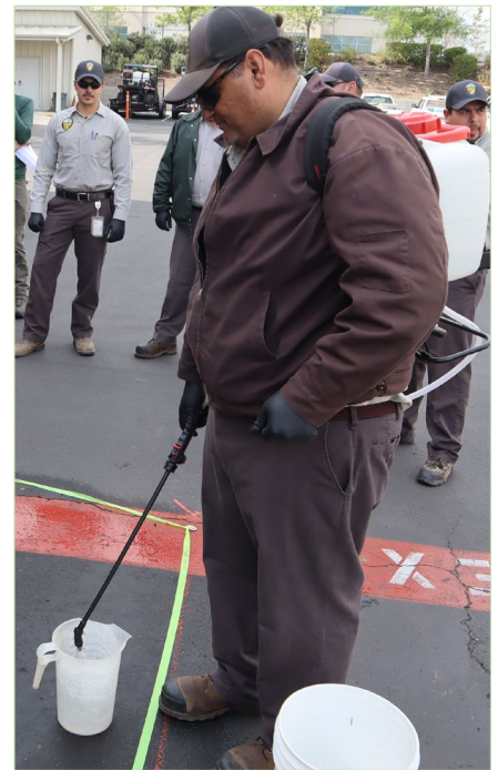
Figure 1. Backpack sprayer pesticide calibration.