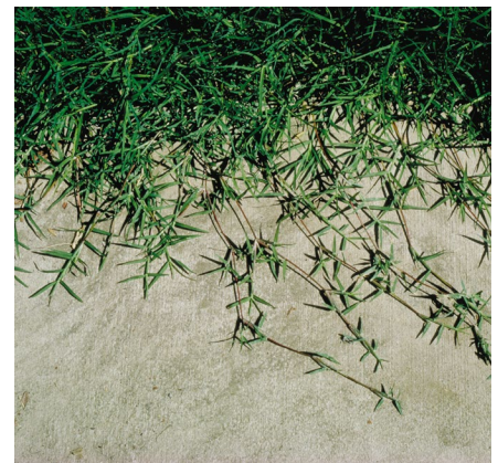
Figure 3. The creeping stolons of bermudagrass.