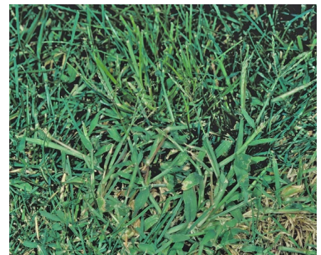
Figure 1. Large crabgrass.

Bermudagrass is hard to pull out and is very tolerant of both drought and mowing. The seed heads look very similar to those of crabgrass (Figure 4). Unlike the other two weeds discussed, bermudagrass can be very