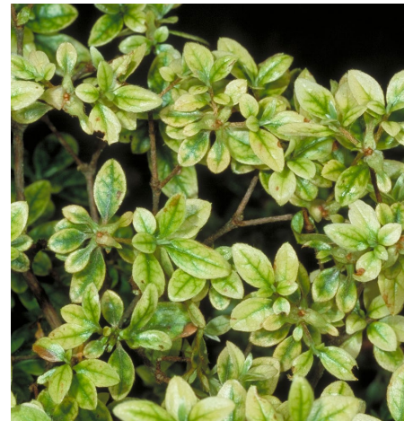
Figure 1. Iron deficiency on azalea.

Inadequate water can negatively impact all plants, including drought resistant species, until they are established. Significant wilting and dieback often occur in newly planted container plants when roots are allowed to dry out too much between irrigation events. If not corrected, such plants will eventually die. Established plants that have moderate to high evapotranspiration rates may also suffer from a lack of water, resulting in leaf scorch and defoliation in addition to wilt. Over time, they will succumb to stunted growth, significant stem and branch die-back (particularly in upper limbs), and eventual death.