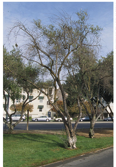
Figure 2. Limb dieback and sparse canopy caused by overwatering.

Many established landscape plants suffer from too much water rather than not enough (Fig. 2). As woody plants age, they should be irrigated more deeply and less often than when they were initially planted and establishing their root systems. Low oxygen levels insufficient for plant growth and development may occur in saturated, poorly drained soils such as clay loams.