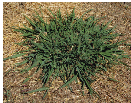
Figure 3. Dallisgrass can withstand drought conditions once established.