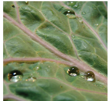
Figure 4. Surfactants can reduce surface tension of liquids. (Wikimedia Commons)

Surfactants can be used if there is no contradiction on the herbicide label for their use. Surfactants are products