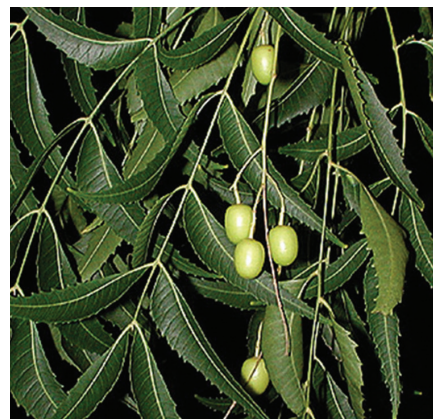
Figure 1. Neem tree fruit and leaves. (G.D. Carr, OSU)

mones necessary for successful molting and reproduction. Azadirachtin competes for molecular binding sites with ecdysone and, therefore, leads to incomplete molting in immature insects, followed by death due to starvation and desiccation. In adult female insects, the same hormonal competition leads to sterility. Additionally, many insects will stop feeding once they have ingested azadirachtin, a behavior that leads to death by starvation. This antifeedant phenomenon has been observed in caterpillars, aphids, true bugs, beetle larvae, grasshoppers, sawflies, and many other insects. Azadirachtin is also known to move systemically within some plant species, so that sprays to one part of a plant may be effective in other parts of the same plant. Azadirachtin, though an important component of neem seeds and leaves, is typically not present in high concentration within neem oil prod-