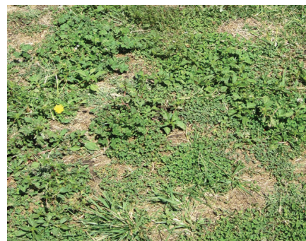
Figure 1. Some weeds thrive in drought conditions.

The effect of drought on preemergence herbicides. Most preemergence herbicides need rain or irrigation within 3 weeks of application to be effective but should optimally receive this “activating” moisture within a day or two of application. Herbicides that remain on a dry soil surface may degrade or volatilize off or can attach to soil particles and blow away. Rain or