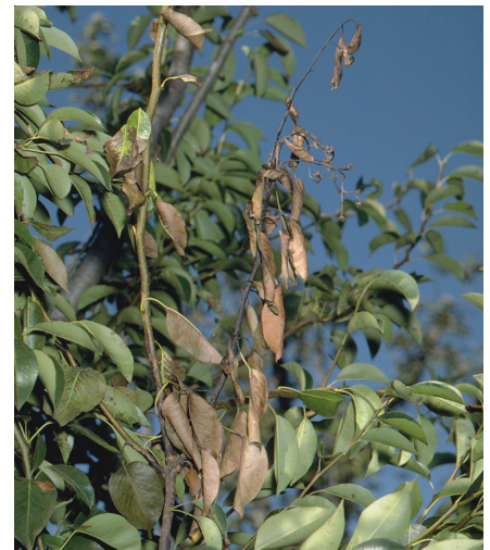
Figure 1. Branches infected with fire blight.

In cases where formative pruning was neglected or insufficient, or where a tree has suffered some physical damage (e.g., from storms or vandalism), pruning can be useful in correcting defects like broken or overlapping branches, double leaders, or poor branch spacing on mature trees. Corrective pruning aims for minimally-sized, properly located pruning cuts that promote successful “compartmentalization,” that is, cuts that allow the tree to seal over with callus tissue on the outside and that limit the spread inside the tree of any decay organisms that may invade. Proper pruning cuts are always preferable to failures (e.g., breaks or “tear-outs”) of branches or leaders, which are often caused by uncorrected structural defects and which frequently result in large wounds that compartmentalize poorly (e.g., because they are located mid-branch or they tear away large strips of bark) and