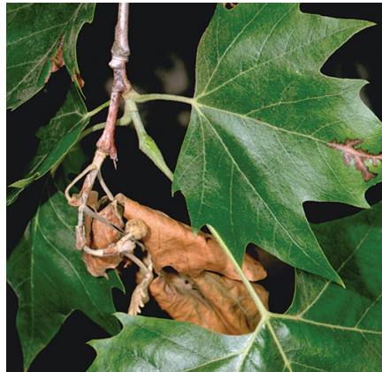
Figure 2. Anthracnose on sycamore twigs.