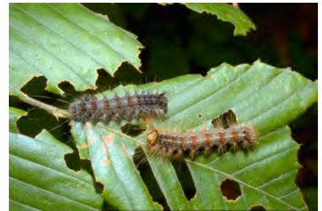
R. Zerillo, USDA-FS