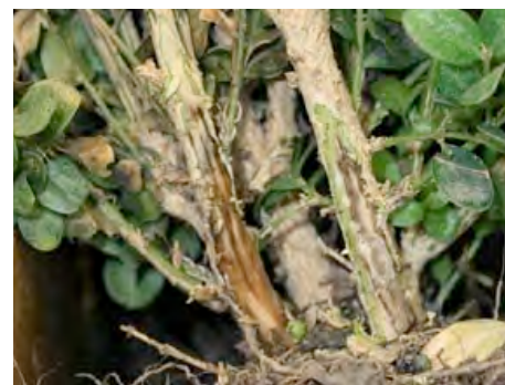
S. Swain, UCCE

Not all problems in the landscape are caused by overwatering. The relationship between drought and wilting is relatively straightforward.