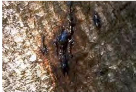
P. Svihra, UCCE

Many other pests not yet established in California threaten our landscape and forest trees. Some of the most serious likely to be brought here in or on wood include the gypsy moth, Lymantria dispar (Figure 5); emerald ash borer, Agrilus planipennis ; Asian longhorned beetle, Anoplophora glabripennis ; and the redbay ambrosia beetle, Xyleborus glabratus , which spreads the fungus causing laurel wilt disease.