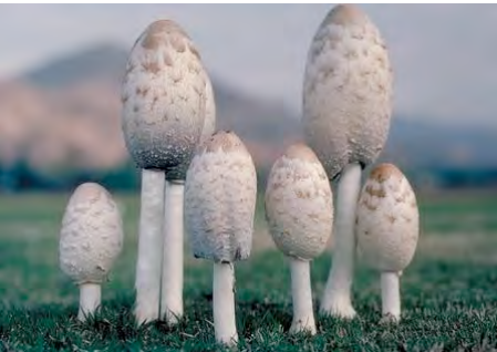
R. M. Davis, UC

M ushrooms, sometimes called toadstools, are the visible reproductive (fruiting) structures of some types of fungi. Although the umbrella-shaped fruiting body is the most common and well known, mushrooms display a great variety of shapes, sizes, and colors. Some other fruiting bodies encountered in lawns include puffballs, stinkhorns, and bird's nests, descriptive names that reveal the diversity of forms among mushrooms. But regardless of shape, the purpose of all fruiting bodies is to house and then disseminate spores, the reproductive units of fungi.