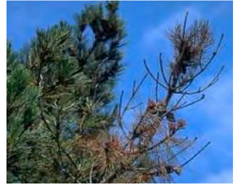
J. K. Clark, UC

To prevent the spread of tree pests, chip or grind small branches and use them as mulch on site or locally. Larger wood can be used locally for firewood, but never transport it more than about 25 to 50 miles. Where invasive pests are a known problem, such as with oaks or other hosts of SOD in central and northern coastal areas and oaks in San Diego County, wood shouldn't be transported beyond the zone of infestation. Check the Web sites listed below for help.