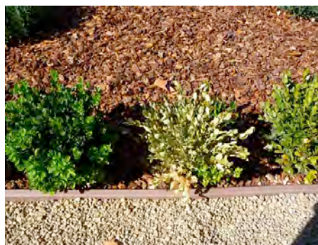
L. Beasley, Distinctive Gardens

Other more tolerant species don't drown directly but tend to develop root infections if their roots stay wet for too long or are irrigated too frequently (Figure 2). The resulting disease or death of the plant is often blamed on the disease organism that attacks the roots, but the disease would have a harder time getting established if the plants were watered correctly in the first place. Once the root systems begin to die, they can't absorb all of the water the plant requires, and the plant begins to