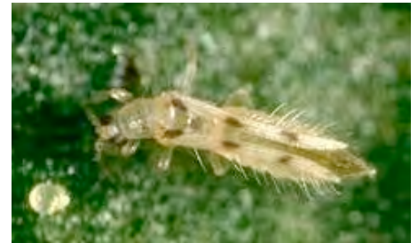
Figure 6. Banded-wing thrips.