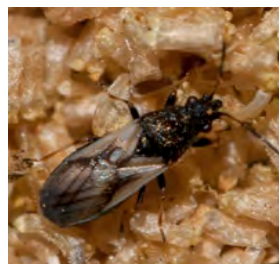
S. V. Swain, UC

I f your clients live in or near an area that stays wet well into summer, such as tidal flats or seasonal wetlands, they may call you with concerns about a small black bug (Figure 1) that occasionally swarms into their houses by the thousands (Figure 2). The bug doesn't have an official common name yet, but it's a seed bug from the Mediterranean whose Latin name is Metapoplax ditomoides . These bugs are harmless to people, although they can be a nuisance in homes and in vehicles such as cars and aircraft that are sometimes parked near moist, flat areas. There are currently no known controls for the problem; however, residents can try to prevent entry into houses by making sure screens on windows and doors are intact and sealing up other entryways. If bugs get into the house, vacuum them up.