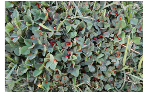
C.A. Wilen, UC

There was no observable difference if the herbicide was applied in the sun or shade. However, on some weed species, especially black medic, the herbicide didn't adhere well to the leaf and beaded up, which