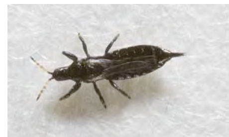
L. L. Strand, UC