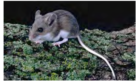
J. K. Clark, UC

For additional up-to-date information on rodent cleanup, visit the Centers for Disease Control and Prevention Web site, http://www.cdc.gov/rodents/cleaning/index.html .