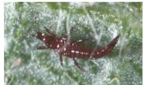
Figure 7. Sixspotted thrips.