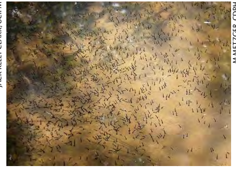
Figure 2. Hundreds of mosquito larvae can develop in even small amounts of water.

a few days. Frequently empty water from trays, fountains, saucers, or other areas. Check drains and make sure there is no debris clogging the drain and holding water.