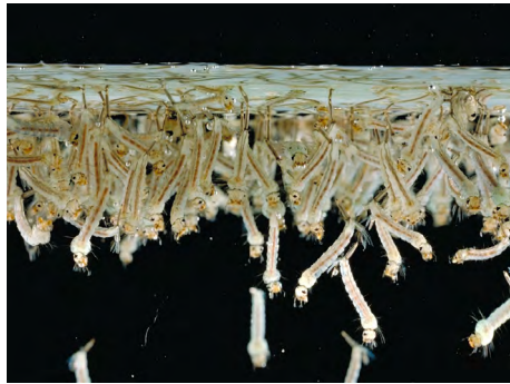
Figure 1. Culex mosquito larvae.

Limit these breeding sites by emptying standing water that will sit for more than