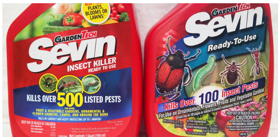
Figure 1. Product labels often look very similar even when the ingredients change. On the left is the product containing zeta-cypermethrin; the one on the right contains carbaryl.

Sevin (Figure 1) is a familiar insecticide brand name for home gardeners used to control insects in lawns, on ornamental plants, and on vegetables. Sevin and the active ingredient carbaryl, are practically synonymous. Recently, the active ingredient in some Sevin products was changed from carbaryl (a carbamate) to zeta-cypermethrin (a pyrethroid).