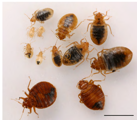
Figure 1. Adult and nymph bed bugs.

Owners and managers of rental properties are required to maintain housing that is safe and habitable. Ask your customer if they are a tenant in a rental housing situation. If so, they should report infestations to their landlord or property manager. In cases where