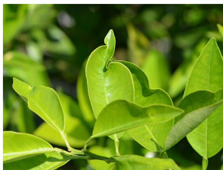
B. GRAFTON-CARDWELL, UCCE