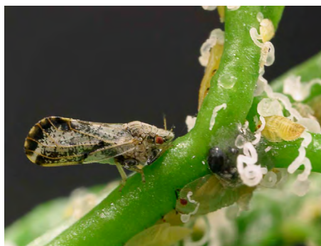
M. E. ROGERS, U. OF FLORIDA

The Asian citrus psyllid adult is tiny—about the size of an aphid. The wings are brown along the edge, with a clear area. The psyllid feeds with its rear end tilted up at a 45° angle, making the insect appear almost thorn-like on leaves and stems. The tilted body and wing pattern is unique to this pest. Juveniles (nymphs) produce white, waxy tubules or strands (Figure 2) and are always found on soft new leaf growth or young stems. The eggs of this insect are yellow and are also found on the newest leaf growth, nestled among unfolded leaves. Eggs are very tiny and hard to see without a hand lens.