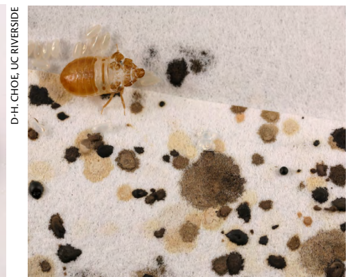
Figure 2. Fecal spots and this shed exoskeleton are useful signs of bed bugs.

landlords refuse to help, there are regional tenants' rights groups that can help find justice for suffering tenants.