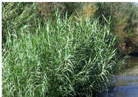
Giant reed, Arundo donax, in a stream.

Invasive plants originally introduced as desirable ornamentals include pampas-grass, big periwinkle, and water hyacinth. Dyer's woad was once a valuable dye plant but now threatens rangeland in Northern California and other parts of the western United States. Many characteristics that make a plant successful as a landscape ornamental, such as ease of propagation and rapid growth, can also