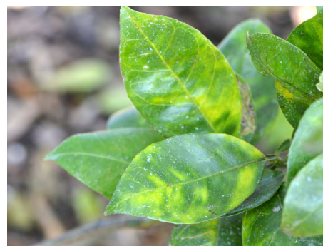
B. GRAFTON-CARDWELL, UCCE