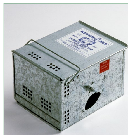
Figure 5. Multiple-capture live trap for mice.

Some dogs and cats will catch and kill house mice and rats. There are few situations, however, in which they will sufficiently control rodent populations. In fact, the presence of