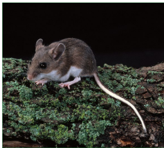
Figure 2. The deer mouse is sometimes found in homes and outbuildings.