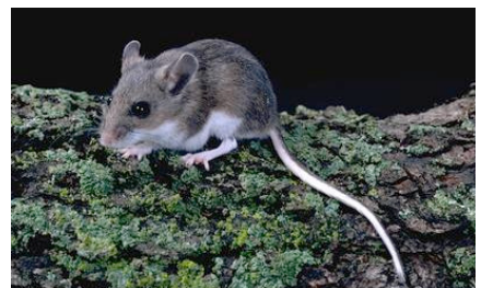
Figure 2. The deer mouse is sometimes found in homes and outbuildings and is a reservoir of the deadly Sin Nombre hantavirus.