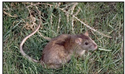
Figure 3. Adult rats, such as this Norway rat and the roof rat below, are much larger than mice.