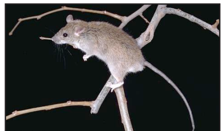
Figure 4. Roof rat.