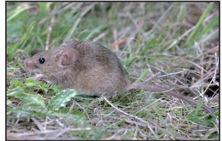
Figure 1. House mouse.

In a single year, a female may have 5 to 10 litters of about 5 or 6 young. Young are born 19 to 21 days after conception, and they reach reproductive maturity in 6 to 10 weeks. The life span of a mouse is usually 9 to 12 months.