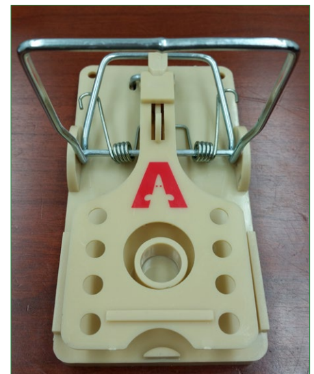
Figure 4. Snap trap with an extended trigger plate.

Live Traps. Multiple-capture live traps for house mice, such as the Victor Tin Cat (Figure 5) and the Ketch-All, are also available from hardware stores and pest control suppliers. They can catch several house mice at a time without being reset, reducing the labor involved. When using such traps, live house mice need to be removed from the trap frequently and humanely euthanized. As stated previously, it is illegal to relocate, or move house mice off the property where they were captured. Relocation is also ineffective; it has been shown that house