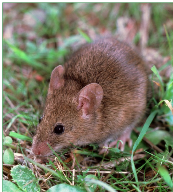
Figure 1. Adult house mouse, Mus musculus .